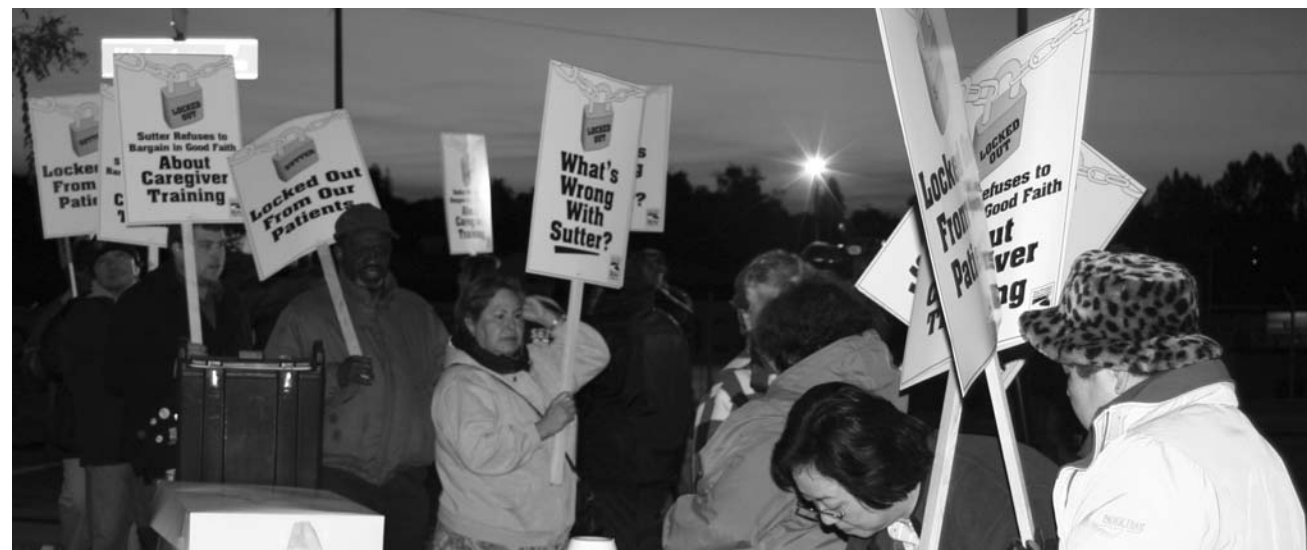
The early morning sun rises behind locked out healthcare workers as they picket Sutter.