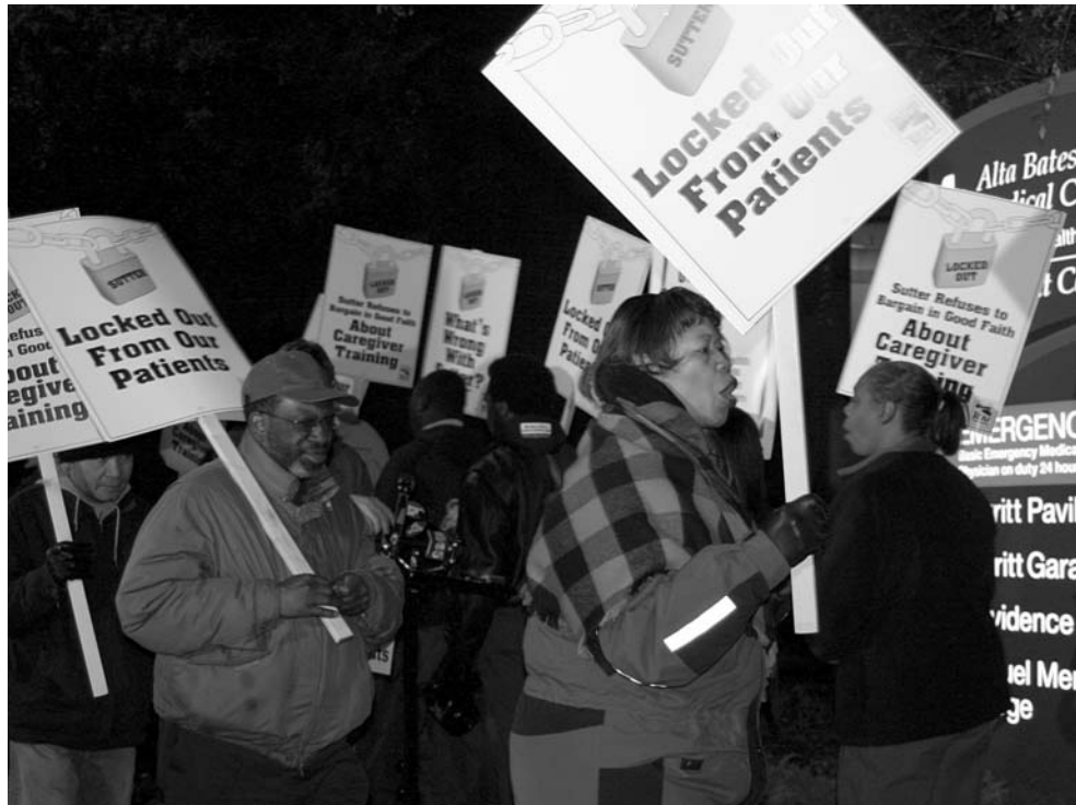
Healthcare workers blocked from working by Sutter start picketing again in the morning darkness.