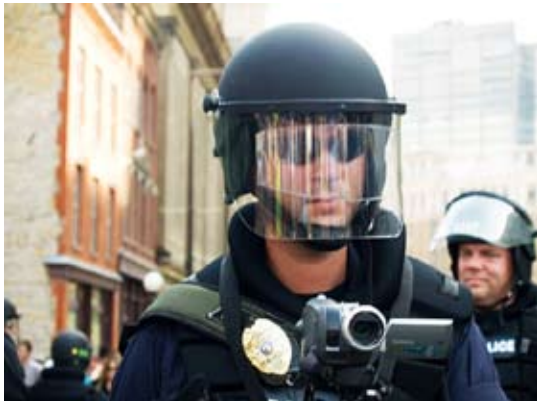
watching you watching us (fucking creepy cop)