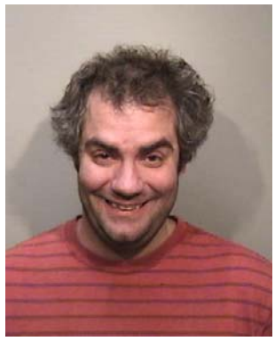
WINTHUNDER, Ahimsa Charges: 245(c) PC x8, 185 PC (Felony)