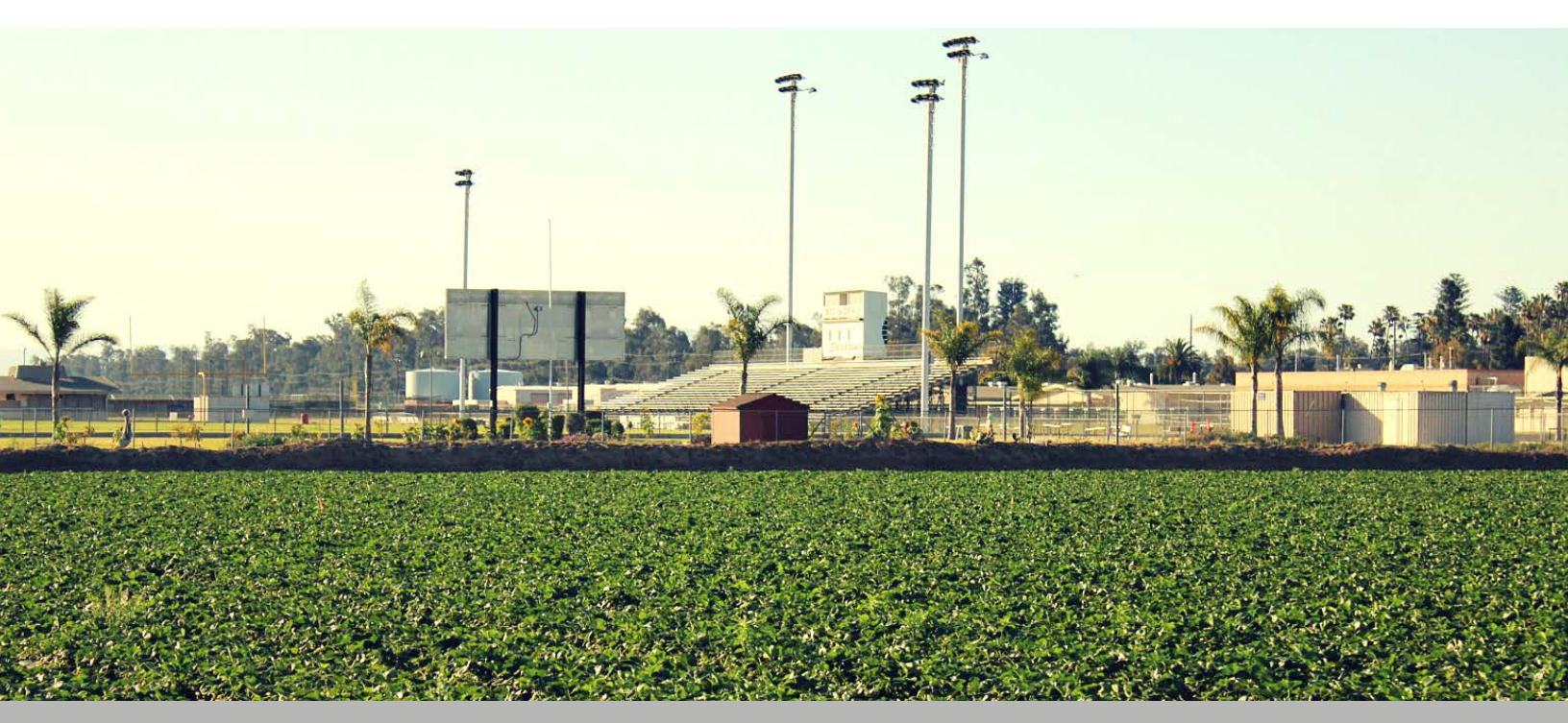
A chain-link fence separates Rio Mesa High School from the strawberry fields that surround it.

Angelita C. "investigation was stalled." <sup>29</sup>EPA did not disclose documents describing why or by whom, but the two methyl bromide reregistration decisions allowing continued use during the investigation and later documents describing resistance from the Office of Pesticide Programs indicates that the pesticide arm of EPA had at least partial responsibility for stalling the investigation.