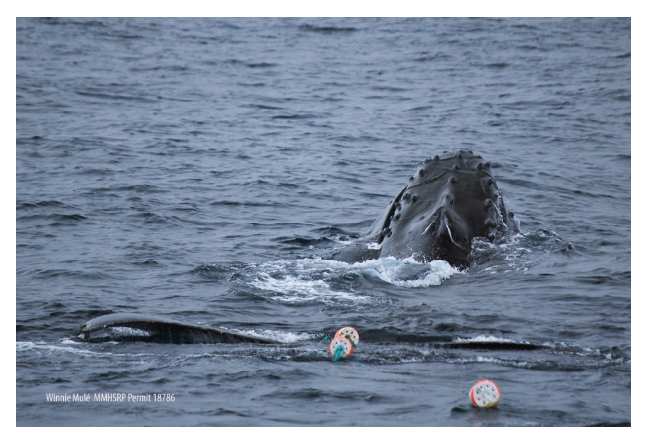
Entangled humpback whale trailing crab pot line and buoys. Monterey Bay on May 10, 2016