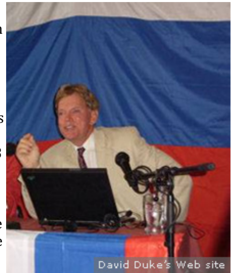
David Duke was the keynote speaker at Euro-Rus, a white supremacist conference that took place in Belgium in June 2008.