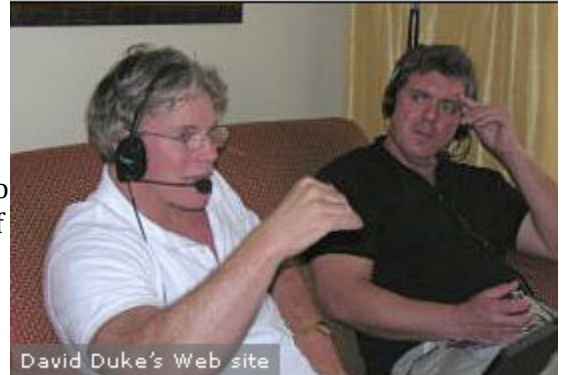
David Duke's Web site David Duke with his protégé Don Black, who runs Stormfront, a white supremacist Internet forum.

Most notably, Duke has a long-standing relationship with Don Black, another former Klansman who has for over a decade operated Stormfront, the largest and most popular extremist Internet forum. Duke often appears on Stormfront's Internet radio program with Black, and Duke has a weekly commentary on Stormfront radio's "Town Hall" segment. Duke invites him to speak at conferences that Duke organizes under the auspices of his European American Unity and Rights Organization (EURO); Black has, in turn, advertised Duke's events on Stormfront. Duke has been a member of Stormfront since 2004 and has made over 1,600 posts to the forum. Black is considered a protégé of Duke, having taken over Duke's leadership position in the Louisiana-based Knights of the Ku Klux Klan group when Duke left in 1980. Black is also married to Duke's ex-wife.