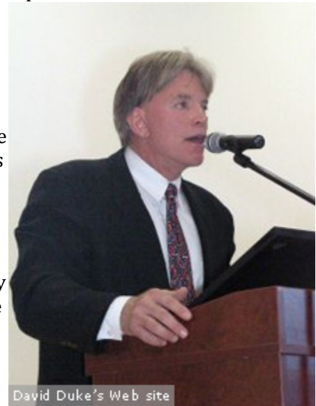
David Duke's Web site

Duke has written articles, books, and other publications in which he spreads his views and attempts to engender hatred in others for minorities and Jews. In Jewish Supremacism: My Awakening on the Jewish Question , a book he wrote in 2002, Duke discussed the "Jewish threat," and offered misreadings of the Talmud and Bible in an attempt to portray contemporary Jews as haters of non-Jews and plotters of the downfall of non-Jewish culture. In December 2007, Duke re-released an "updated and expanded" version of the book and wrote on his Web site, "Specifically, Jewish Supremacism examines a long record of Jewish supremacist ideology and history that have had a powerful and damaging effect on both the Jewish and Gentile world." His new preface was aimed at attacking the