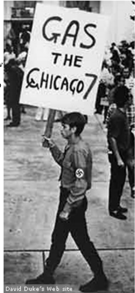
David Duke's Web site

Young David Duke at work. Duke now describes this event as a folly of youth.