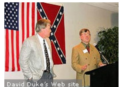
David Duke's Web site David Duke with neo-Nazi Kevin Alfred Strom at Duke's 2004 EURO conference

Extremists from the United States and around the world have attended Duke's EURO conferences. In addition to attending his events, several of these individuals have given speeches supportive of Duke's ideology. The list of these affiliates and supporters includes the now-deceased John Tyndall, founder of the British National Party; neo-Nazi Kevin Alfred Strom; Don Black; virulent anti-Semite Willis Carto, who publishes the anti-Semitic newspaper American Free Press and The Barnes Review , a Holocaust denial publication; anti-Semitic attorney Edgar J. Steele; Holocaust denier Germar Rudolf; Nick