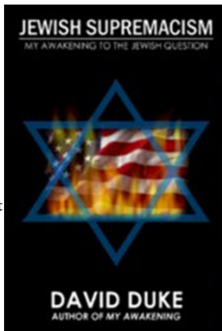
In this book, written in 2002, Duke discussed the “Jewish threat.”

and unnamed “Zionists” and their role in various world events including the 9/11 attacks, the Iraq war, illegal immigration or any fluctuation in the U.S. economy. Since September 11, Duke has reiterated his belief that Israel and the Mossad perpetrated the terrorist attacks on the World Trade Center and the Pentagon. He has insisted that the Mossad warned 4,000 Jews who worked at the World Trade Center to stay home on the day of the attacks, while allowing thousands of innocent Americans to die. Duke’s “proof” further reveals his bigotry--he has said that since Jews control finance, more Israelis/Jews should have died in the World Trade Center. He has also stated that Israel carried out the attacks to turn attention away from its treatment of the Palestinians.