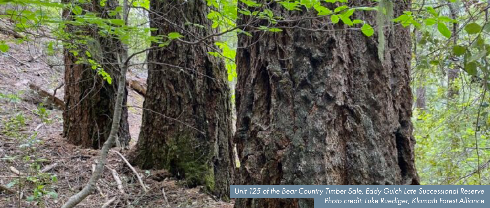
Unit 125 of the Bear Country Timber Sale, Eddy Gulch Late Successional Reserve