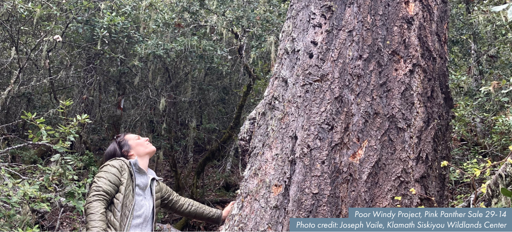
Poor Windy Project, Pink Panther Sale 29-14