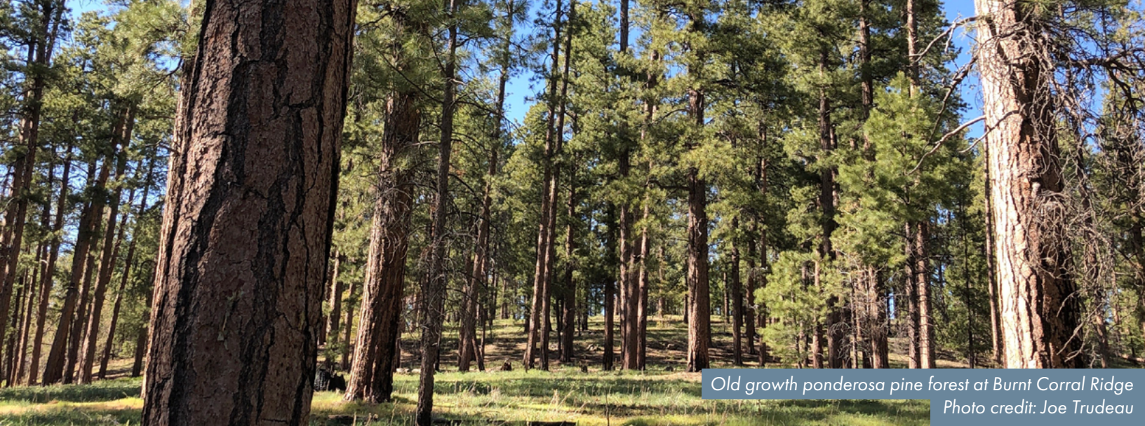
Old growth ponderosa pine forest at Burnt Corral Ridge