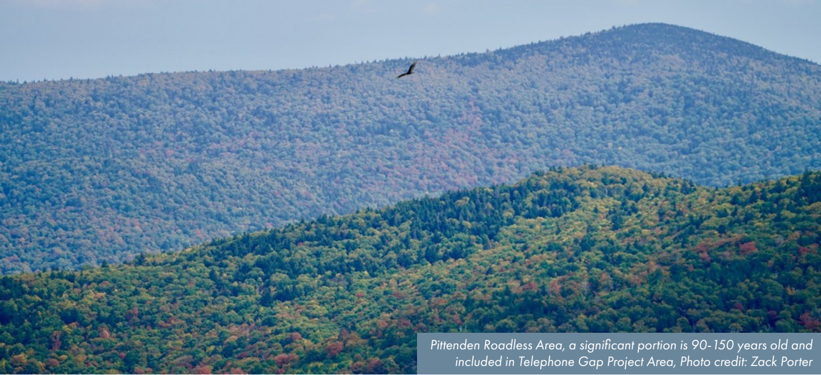
Pittenden Roadless Area, a significant portion is 90-150 years old and included in Telephone Gap Project Area, Photo credit: Zack Porter