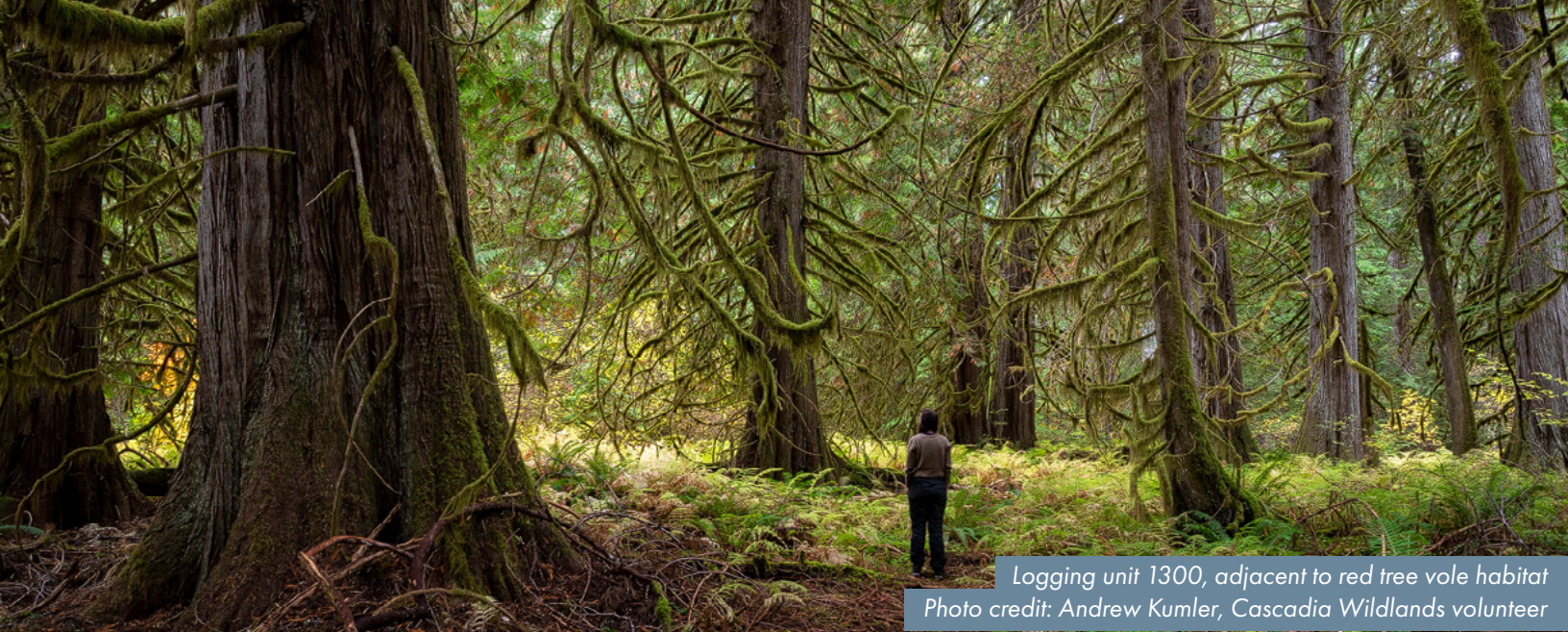
Logging unit 1300, adjacent to red tree vole habitat