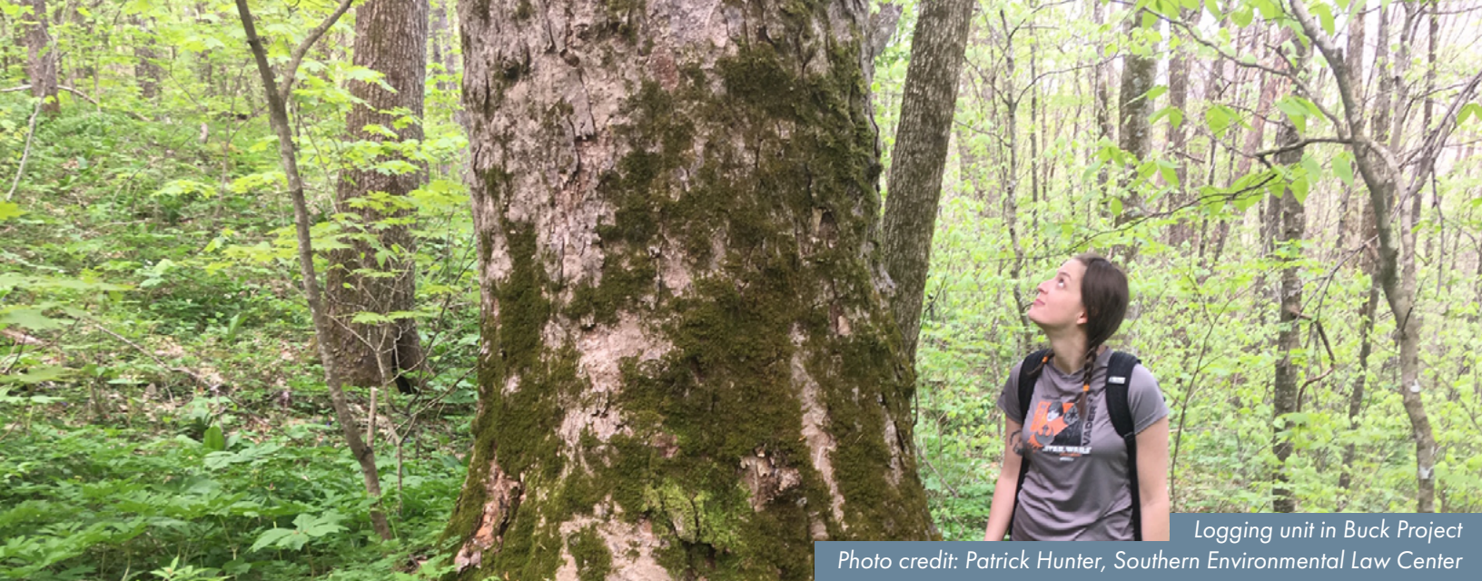
Logging unit in Buck Project