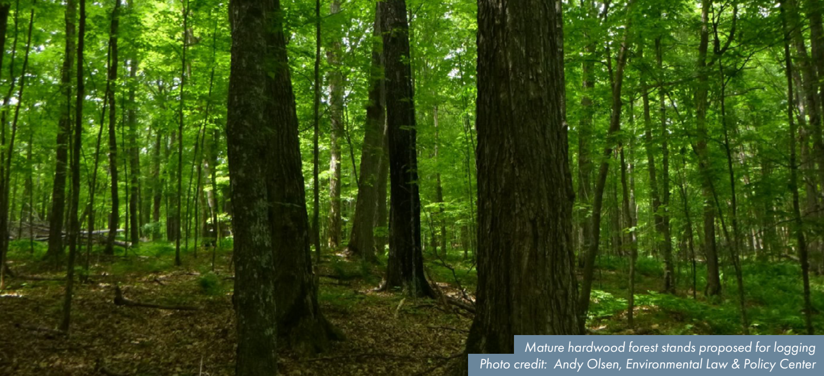
Mature hardwood forest stands proposed for logging