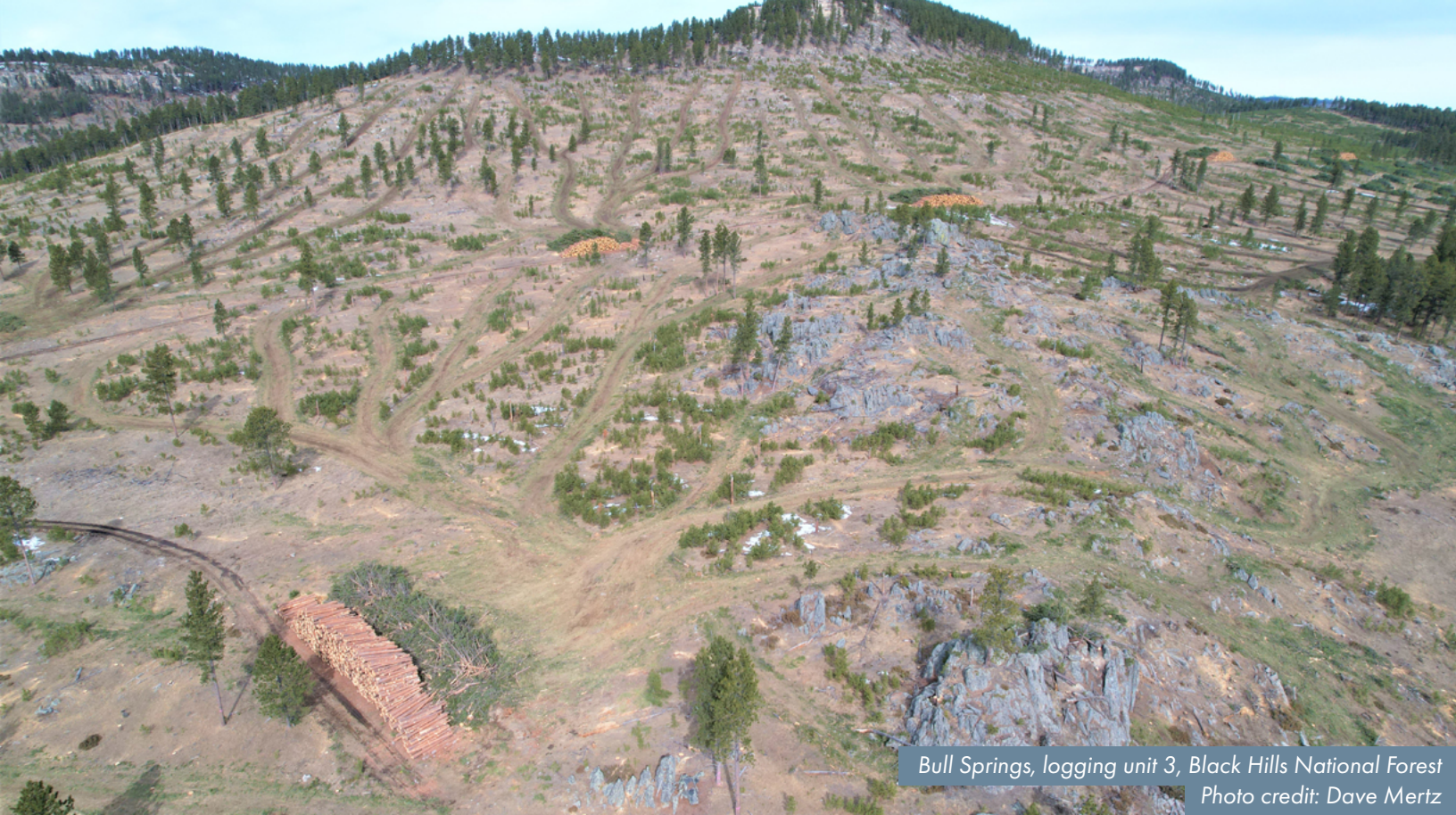
Bull Springs, logging unit 3, Black Hills National Forest